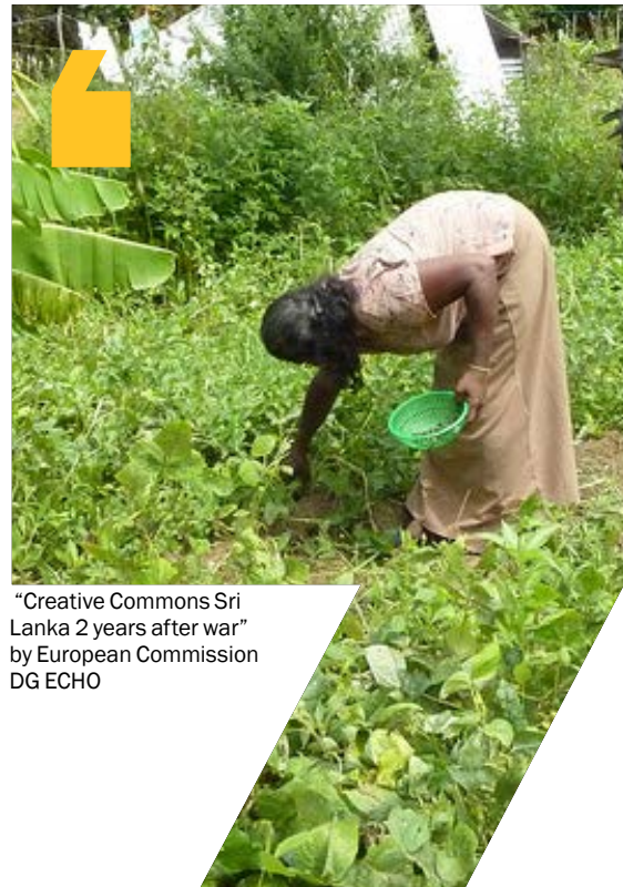
"Creative Commons Sri Lanka 2 years after war"

The Samurdhi programme, implemented since 1994, is the main safety net programme in Sri Lanka. The programme has undergone considerable change during the past few years and is now mainly structured as two components: the relief programme and the empowerment programme. The relief component encompasses the cash-transfer programme, social security fund and nutrition programme. The empowerment component consists of five initiatives: rural infrastructure, livelihood, social development, the Samurdhi housing programme and microfinance through Samurdhi Bank societies. The relief component provides consumption support and social insurance for households below a certain level of income. While the welfare grant provides immediate relief, the insurance scheme has a longer term objective of poverty alleviation as it aims at reducing the vulnerability of the poor in the face of life contingencies such as death, birth, marriage or sickness in the family. Beneficiaries are entitled to a lump sum upon the occurrence of one of the contingencies, varying according to the contingency. Some of these payments indirectly target women